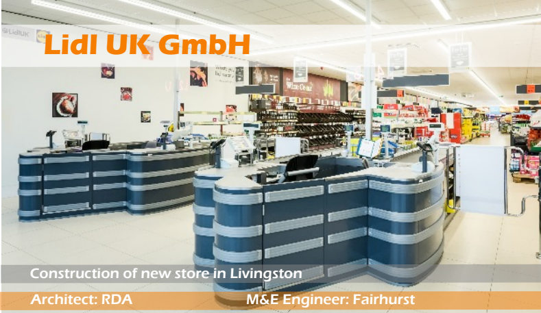
Construction of new store in Livingston