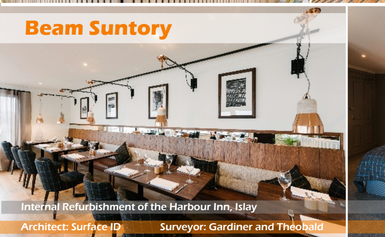
Internal Refurbishment of the Harbour Inn, Islay