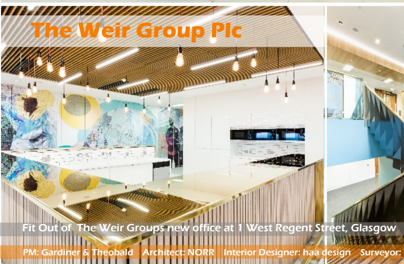
Fit Out of The Weir Groups new office at 1 West Regent Street, Glasgow