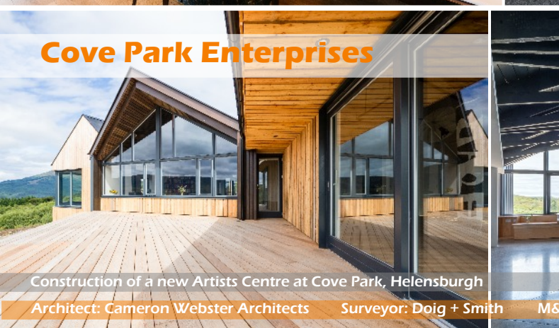
Construction of a new Artists Centre at Cove Park, Helensburgh